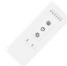
Single color 6-channel remote