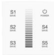
single color 4-channel touch dimmer