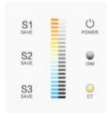
CCT adjustable touch dimmer