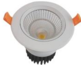
X3 series downlight