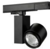
G series track light