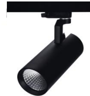
M series tracklight