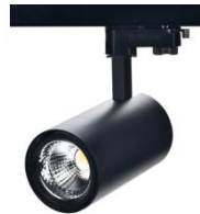
F1 series tracklight