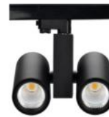
N series track light