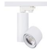
H series track light