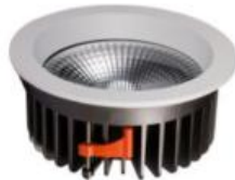
X5 series downlight