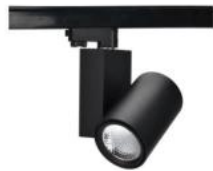
C series track light